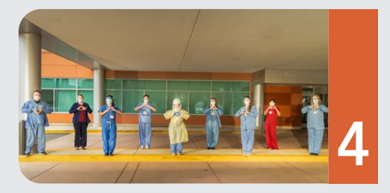
Preparing for and responding to a pandemic: COVID-19 at CWHC